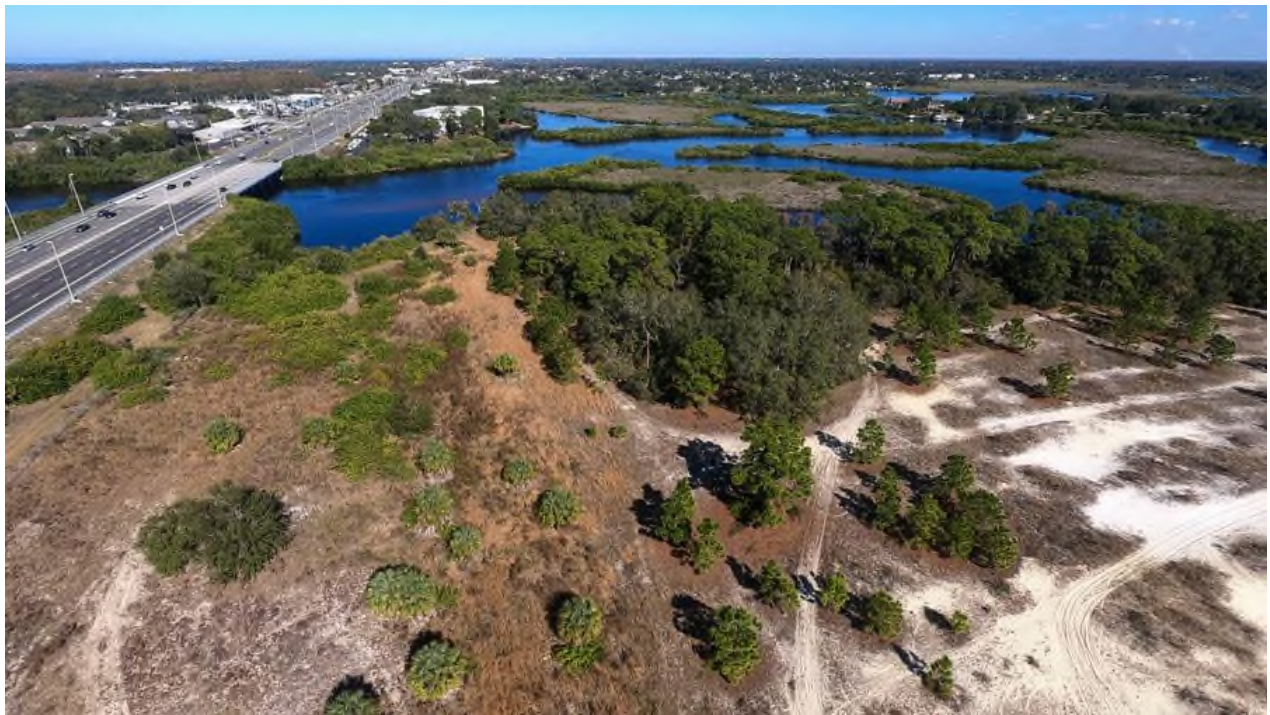
Vacant land butting up to the Anclote River can be seen Friday, Dec. 11, 2020 in Tarpon Springs where Morgan Group plans to build 404 apartments.